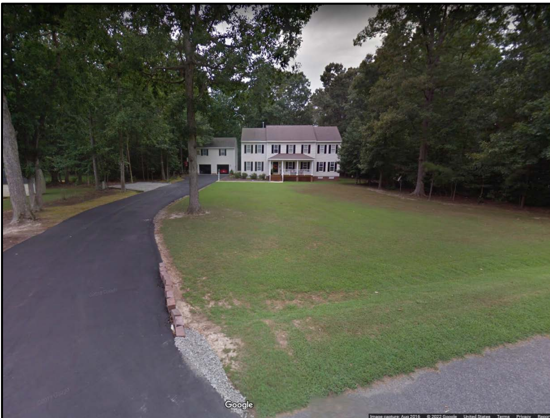
Figure 3: View of 11741 Riverpark Way from Riverpark Way

The conditions recommended for this proposal limit the occupancy to the occupants of the principal dwelling and individuals related to them ( Condition 1 ). Additionally, a deed restriction recorded against the property will provide for the limitation of the use to family members ( Condition 2 ). As conditioned, the use should not adversely affect area residential uses.