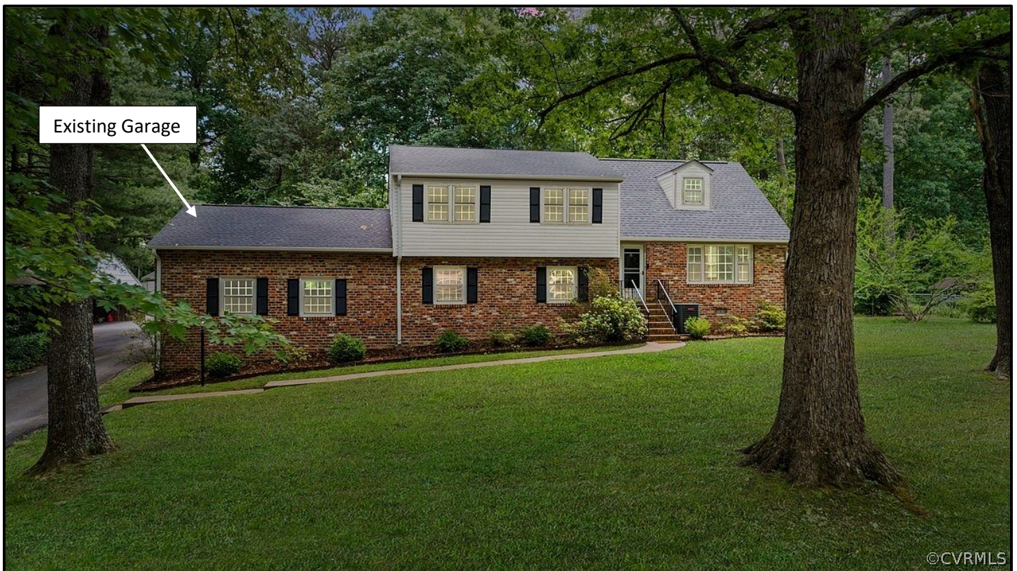
Figure 3 Existing Dwelling at 13009 Deerpark Drive

The conditions recommended for this proposal limit the occupancy to the occupants of the principal dwelling and individuals related to them ( Condition 1 ). Additionally, a deed restriction recorded against the property provides for the limitation of the use permit ( Condition 2 ). As conditioned, the use should not adversely affect area residential uses.